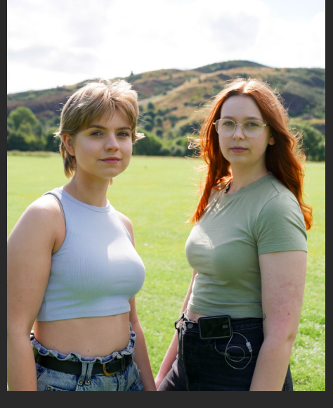
Scylla's Bite Company of the Year